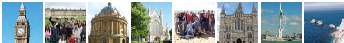
Trip destinations (left to right): London, Bath, Oxford, Winchester, Bournemouth, Salisbury, Portsmouth, Isle of Wight