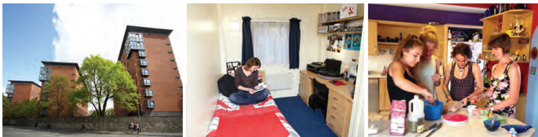
Left to right: Residential accommodation, bedroom in residence, homestay accommodation.